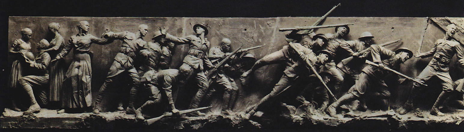
The central feature of the proposed World War I memorial is this narrative allegory in bronze by sculptor Sabin Howard . . .

on Freedom Plaza, which is bereft of the surrealistically large architectural models of the Capitol and White House as well as the pair of flattened pylons framing a vista of the Treasury Department building's south portico that Venturi intended. The vast plaza's only vertical elements are a couple of flagpoles.) The Pershing Park block was once occupied by residential and, later, commercial buildings, demolished after its acquisition by the federal government in 1928 to amplify views of the Commerce Department building, which was completed four years later. Since then the block has mostly served as a park, though temporary federal office buildings were erected there during World War II.