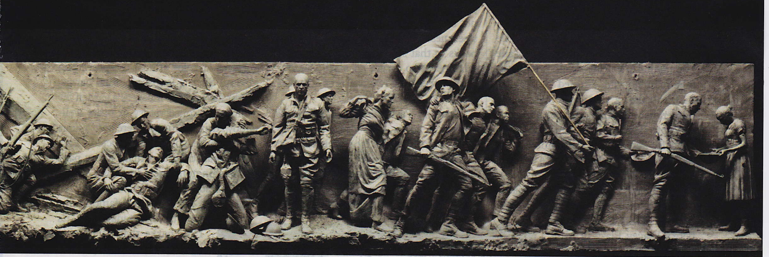
... with 38 figures depicting a soldier's path from home to the crucible of the battlefield and back home again.

appears content to sink the Weishaar-Howard design because it considers retaining the “visual, auditory and tactile [!] qualities” of Friedberg’s pool more important than civic commemoration. This is perverse.